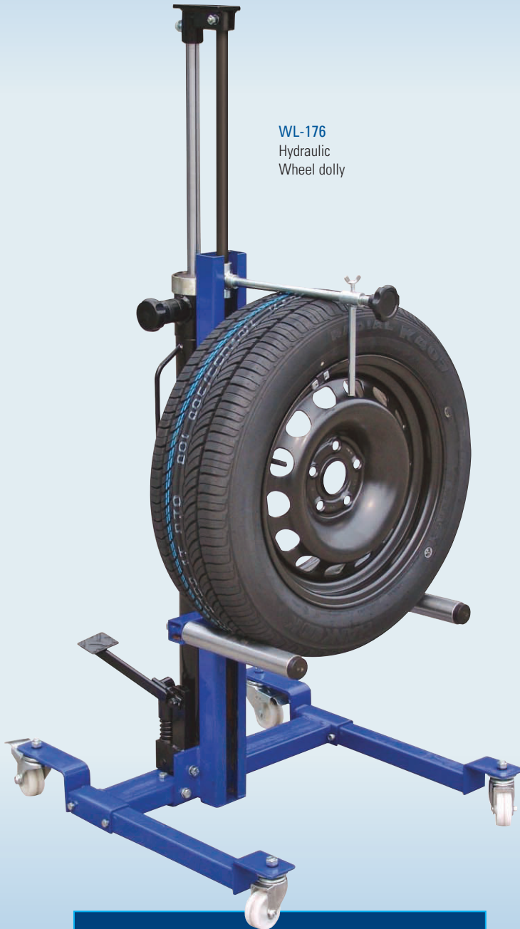
WL-176 Hydraulic Wheel dolly

Designed to aid in the removal and installation of wheels on cars, SUVs and light trucks. Ideal for transporting wheels to and from wheel service equipment.